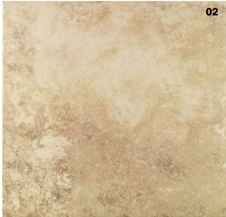
Floor Tile: VERA TERRA COLOUR: 02

Disclaimer: The various finishes and sizes shown are not necessarily available in all colours. For specific information on size, finish and colour availability, please contact a PROSPEC representative.