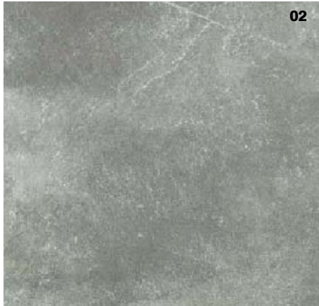
Floor Tile: TERRA MARCATA COLOUR: 02

Disclaimer: The various finishes and sizes shown are not necessarily available in all colours. For specific information on size, finish and colour availability, please contact a PROSPEC representative.