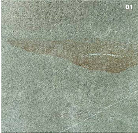
Floor Tile: ISONZO COLOUR: 01

Disclaimer: The various finishes and sizes shown are not necessarily available in all colours. For specific information on size, finish and colour availability, please contact a PROSPEC representative.