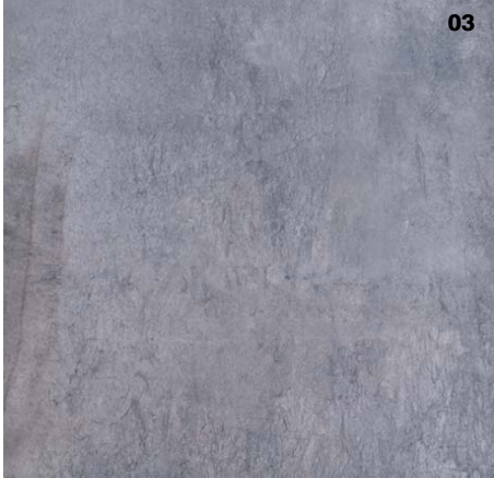
Floor Tile: CORINTH COLOUR: 03

Disclaimer: The various finishes and sizes shown are not necessarily available in all colours. For specific information on size, finish and colour availability, please contact a PROSPEC representative.