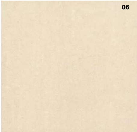
Floor Tile: ADIGE/2.0 COLOUR: 06

Disclaimer: The various finishes and sizes shown are not necessarily available in all colours. For specific information on size, finish and colour availability, please contact a PROSPEC representative.