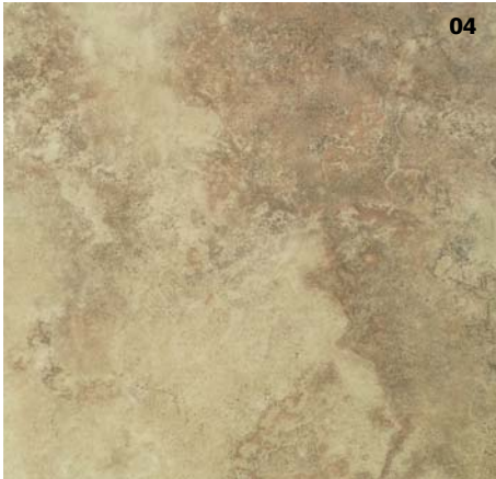
Floor Tile: ANETO COLOUR: 04

Disclaimer: The various finishes and sizes shown are not necessarily available in all colours. For specific information on size, finish and colour availability, please contact a PROSPEC representative.