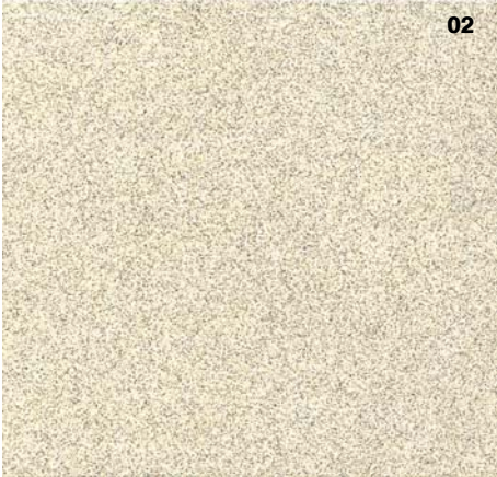
Floor Tile: TRAFFIC COLOUR: 02

Disclaimer: The various finishes and sizes shown are not necessarily available in all colours. For specific information on size, finish and colour availability, please contact a PROSPEC representative.