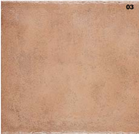
Floor Tile: EARTH COLOUR: 03

Disclaimer: The various finishes and sizes shown are not necessarily available in all colours. For specific information on size, finish and colour availability, please contact a PROSPEC representative.